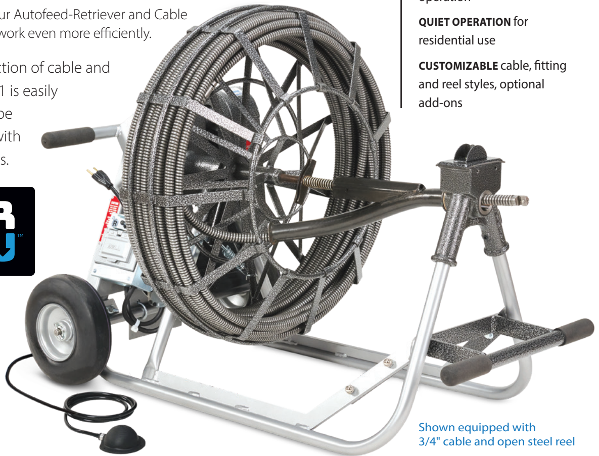
Shown equipped with \frac{3}{4} " cable and open steel reel