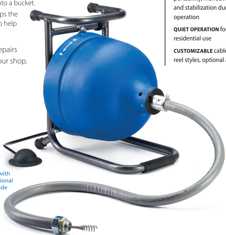
Shown equipped with 1/4" cable and optional elephant trunk guide