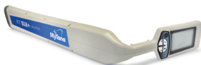
MT 512+ Locator