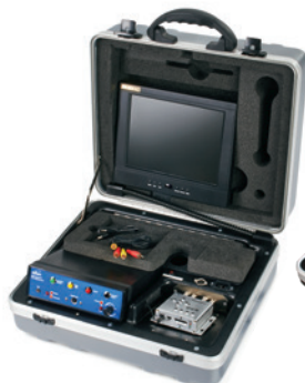
ACB13 Control Box