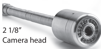
2 1/8" Camera head