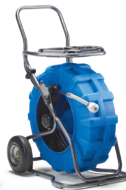
NGX10 or MY30