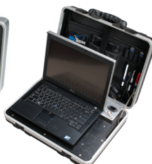
DCB12 Control Box